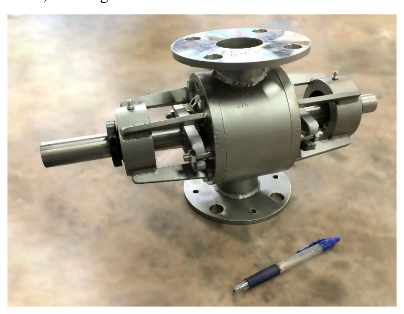
2" Model HC Drop-Thru Rotary Valve

Selecting the correct Rotary Valve for the application is critical for a process to operate correctly. Young Industries Model HC Rotary Valve is a clear choice for those applications handling powders with poor flow characteristics. The Model HC Rotary Valve is available in sizes 1" through 24" as standard, with larger sizes also available. The Model LH is available in sizes 4" through 24" as standard, with larger sizes also available.