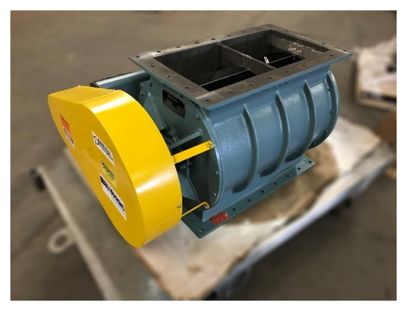
12"x24" Model HC Rotary Valve