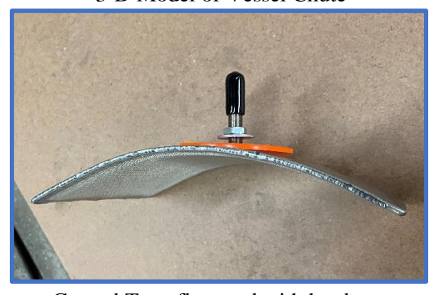
Curved Transflow pad with hardware