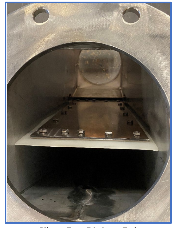
View - From Discharge End

The valve shown is a 6" – 304S/S Asymmetric Blade Diverter Valve with square flanged inlet, round flange discharge on the straight through leg and round plain end stub on the 45-degree offset leg. It uses a rotary pneumatic actuator.