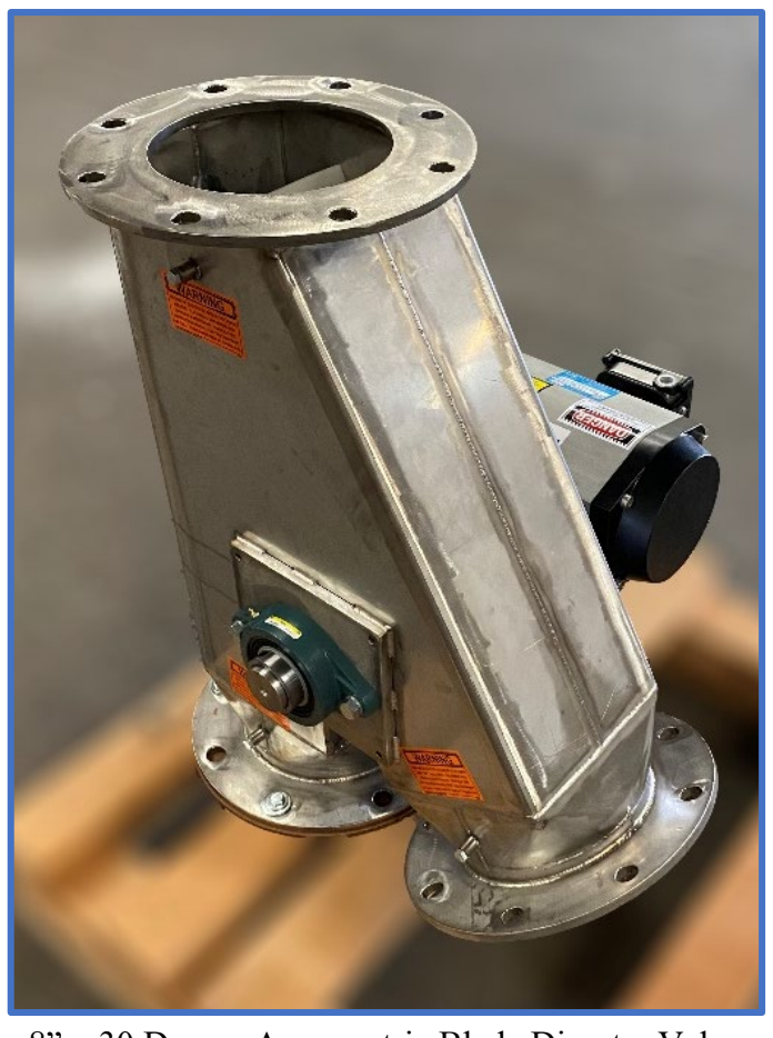
8" – 30 Degree Asymmetric Blade Diverter Valve