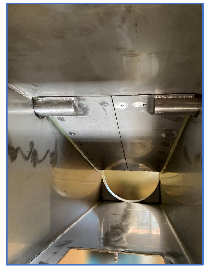
View – Interior From Inlet End