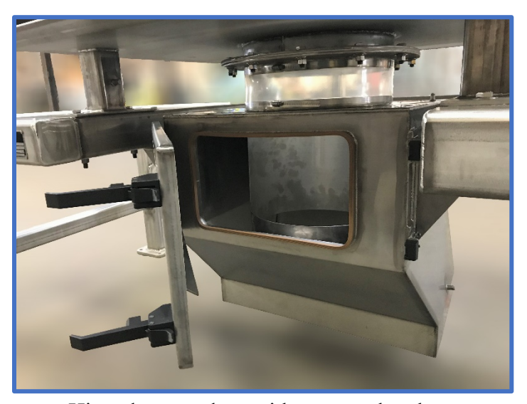
Hinged access door with rectangular chute

Solution: Young Industries Engineers met with the customer and established the available space to unload the bulk bags. A special support frame is needed to straddle the mix tank for powder to feed directly to the rectangular opening of the tank.