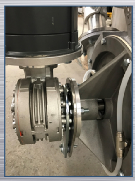
SHAFT MOUNTED DRIVE Direct driven shaft mounted gearmotor is standard

SHAFT SEAL PURGE CONNECTION IS OPTIONAL Air purge allows the user to purge the seal with 1-2 PSIG compressed gas.