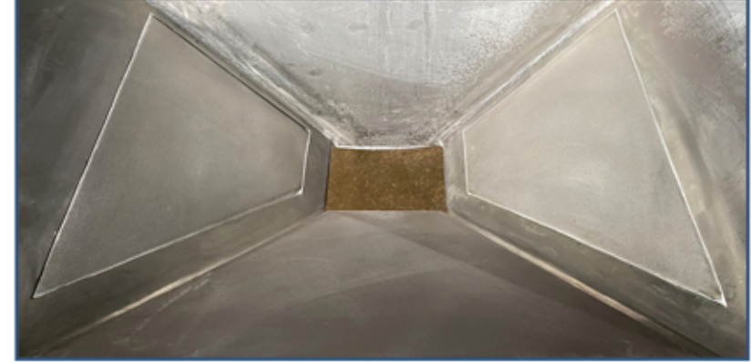
Transflow Pads in Pyramid Hopper

Young Industries Application Engineering staff can help specify the Transflow Pad that will work for you. Testing of our Transflow products is available in our test facility in Muncy PA.