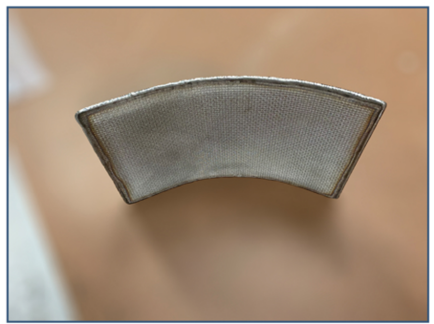
Curved Transflow Pad