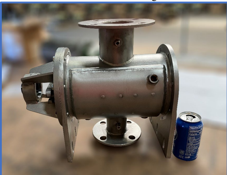
Mixer Body Next to a Standard 12 oz. Can

This mixer was designed and manufactured with input from the customer to meet their exact application needs.